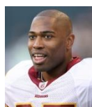
Shaun Alexander former NFL MVP; Seahawks, 'Skins